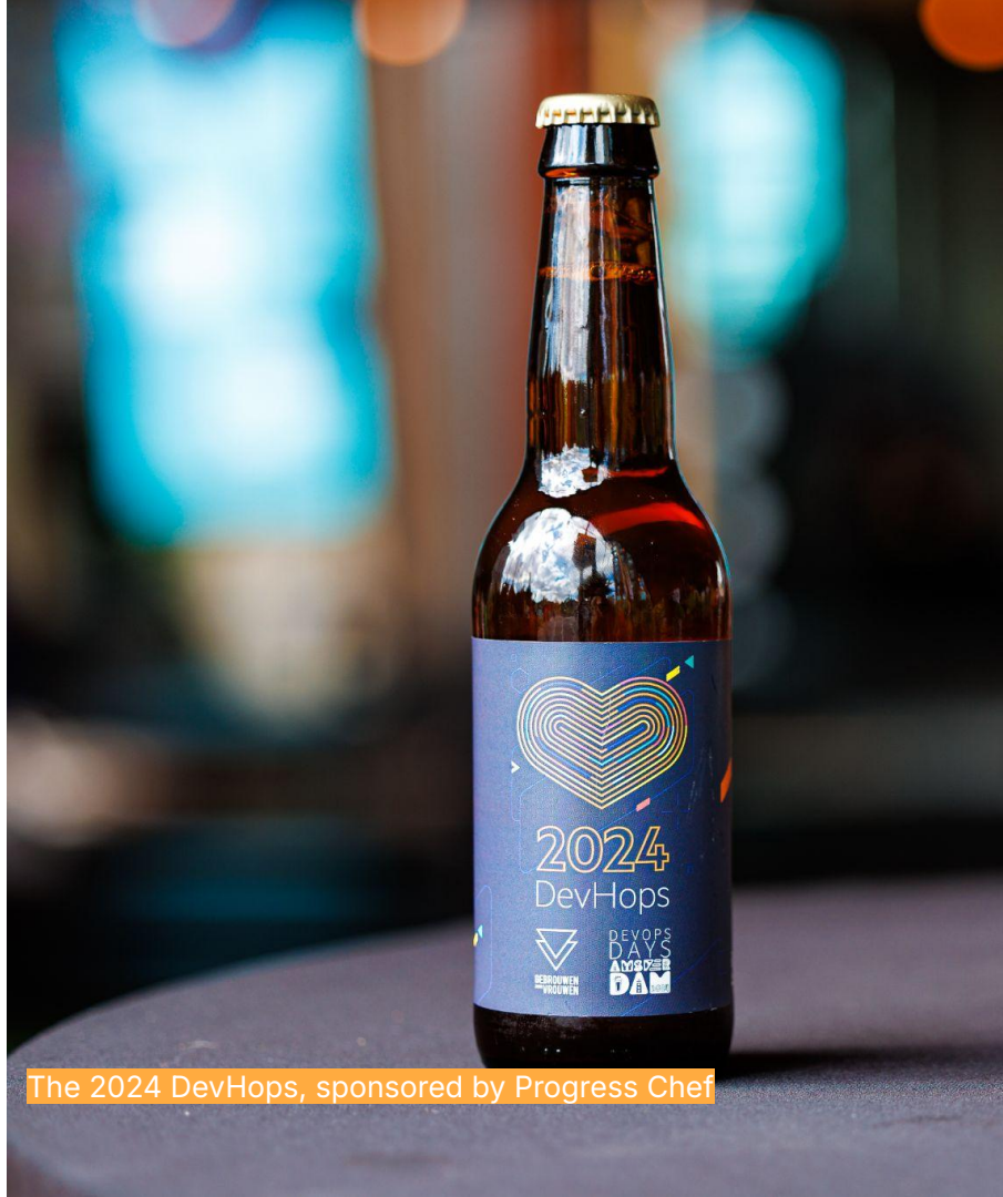
The 2024 DevHops, sponsored by Progress Chef

Please reach out to us if you have any questions or need something clarified. We can be reached at: amsterdam@devopsdays.org