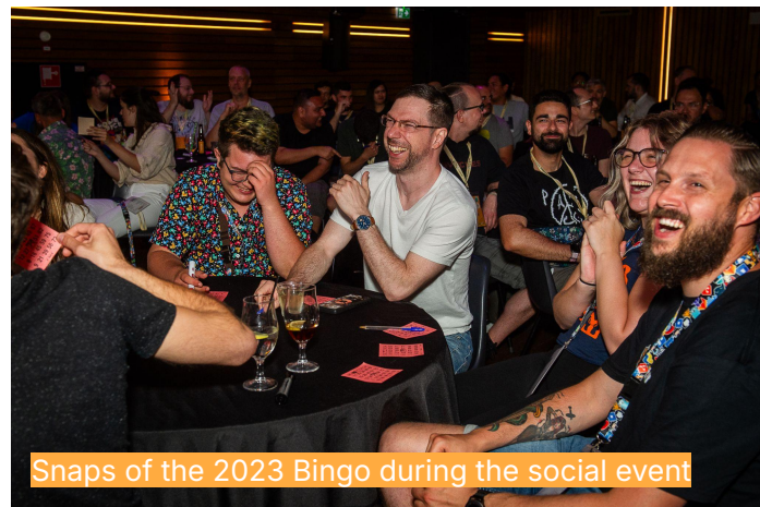
Snaps of the 2023 Bingo during the social event