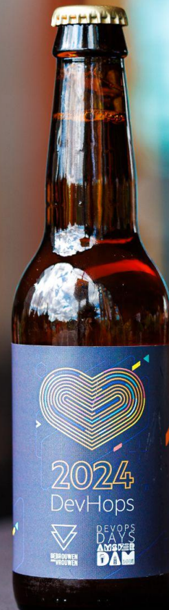
The 2024 DevHops, sponsored by Progress Chef