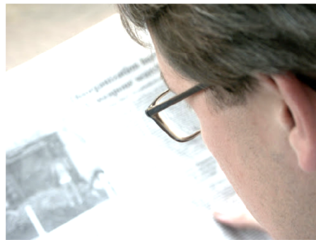
Diversity at DevOpsDays Wellington

"Huge thanks to @DefSol and @devopsdaysnz organizers and volunteers for an incredible experience. Best run conference I've been to, I reckon."